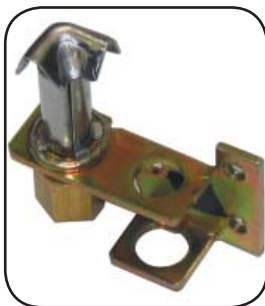
#RS5CHR761 Natural Gas