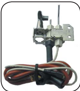
#W0125 - E48-32