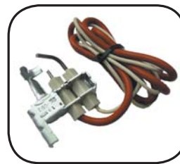
#W0126 - E48-33