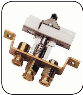
#P1525A Natural Gas