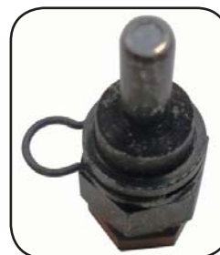
#W69260 - Natural Gas Injector