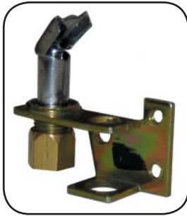
#RS2CH6062 Natural Gas