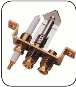
#P1525 Natural Gas