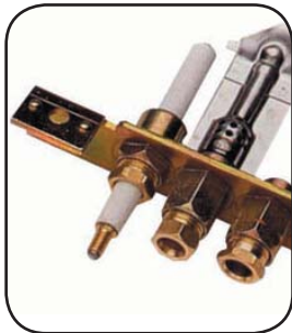
#P1526 Natural Gas