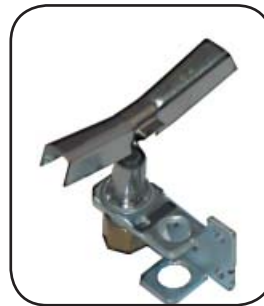
#RS6CH24 Natural Gas & LPG Kit