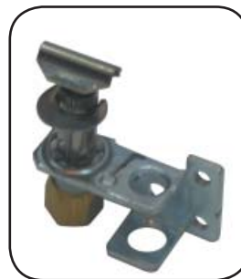
#RS76510 Natural Gas & LPG Kit