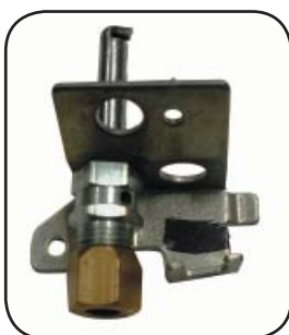
#RS2BLC5021 Natural Gas