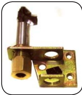
#RS5CHL760 Natural Gas