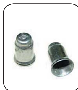
#RS76360 Natural Gas Pilot Stud