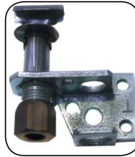
#RS3CHA-1 Natural Gas