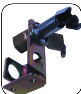
#RS2CHR629A Natural Gas