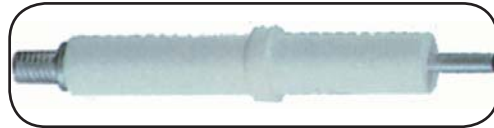
#P4030 Ignition Electrode To suit Polidoro Pilots