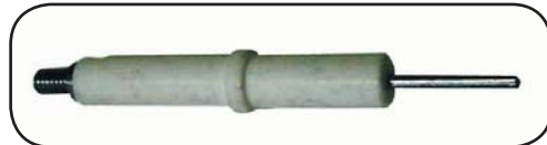
#P4016 Flame Rod To suit Polidoro Pilots