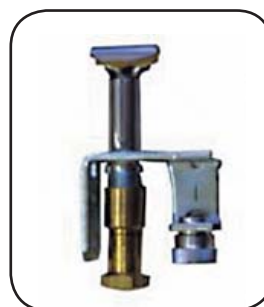
#RS1830 - 006 Natural Gas & LPG Kit