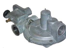
Jeavons J125 Regulators 3/4" to 2"