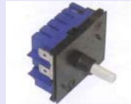
Isolated Pilot Solid Shaft