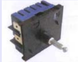
Isolated Pilot Divided Load

ENERGY REGULATOR SINGLE POLE RSMD3V-800K