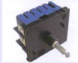
Integrated Pilot 75° C.W Simmer Angle