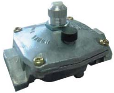
Appliance Regulators 3/8" to 3/4"