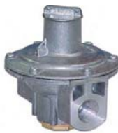
Jeavons J78 Regulators 1/2" to 1"