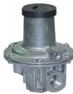
Jeavons J48 Regulators 3/4" to 2"