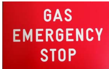
Wall Label # L0201-TRAF