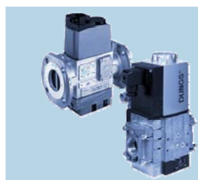
Multi Function Valves

Phone: 09 636 1401 Fax: 09 636 1525 Email: sales@systemcontrol.co.nz www.systemcontrol.co.nz