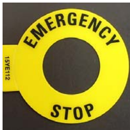
Included with the above # L0201 & # L0203