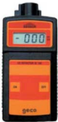
Part Number: GE.ID155