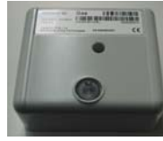
509SE Riello Gas Burner Control # R83001139