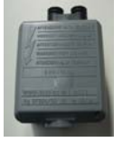
530SE Riello Oil Burner Control # R83001156