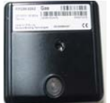
RMG88.62A Riello Oil Burner Control # R83013073