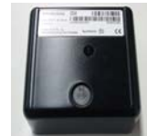
RM088.53A2 Riello Oil Burner Control # R83013071