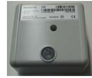
503SE Riello Oil Burner Control # R83001150