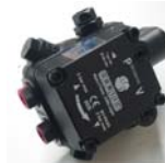
Pump (suntec) Press GV's