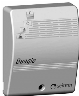
Fig. 1: External aspect.